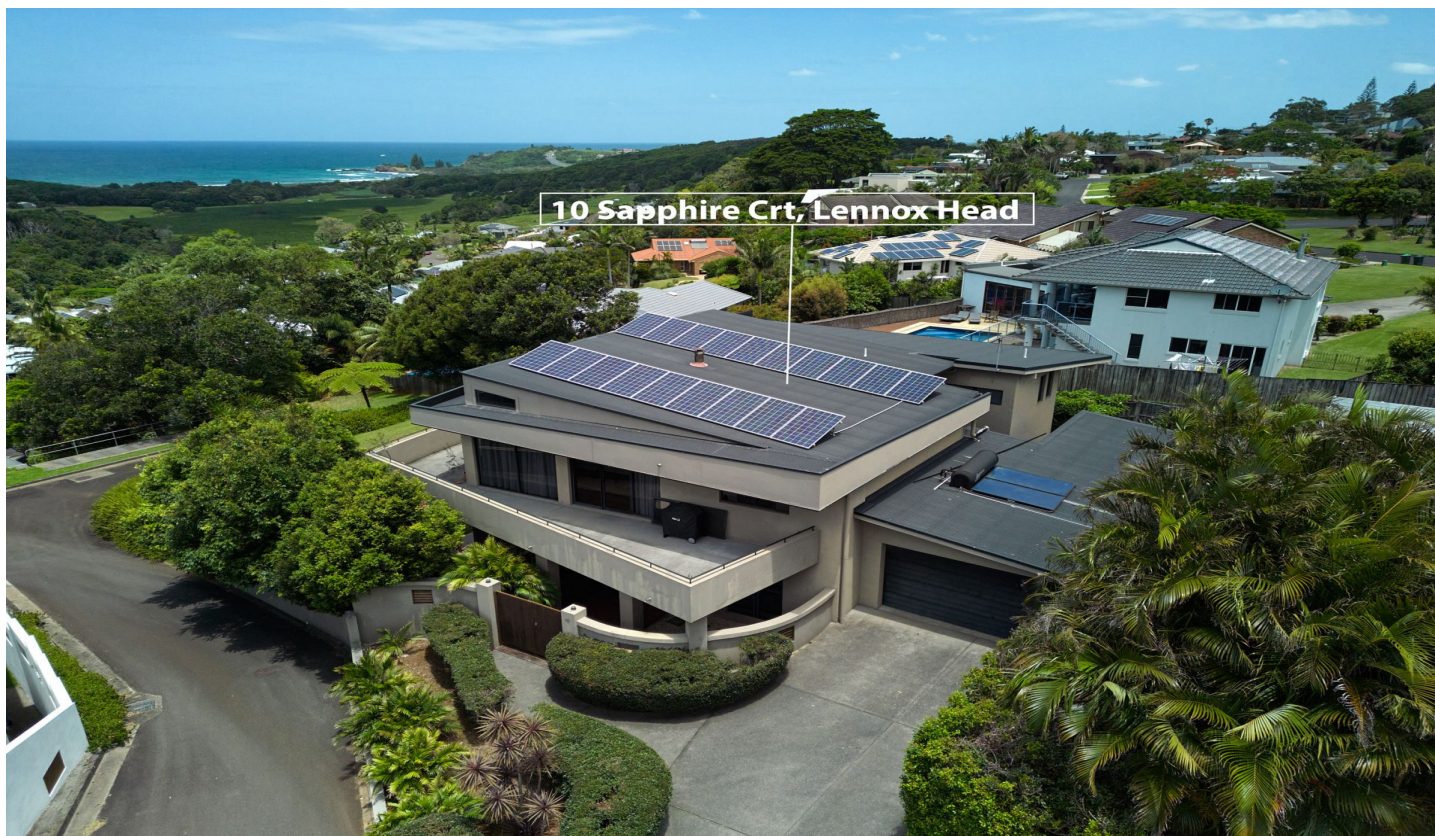
10 Sapphire Crt, Lennox Head