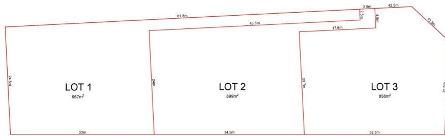
LOT LAYOUT SCALE 1:200 @ A1

This plan is NOT to be used for construction purposes unless it carries the approval stamp of the local authority.